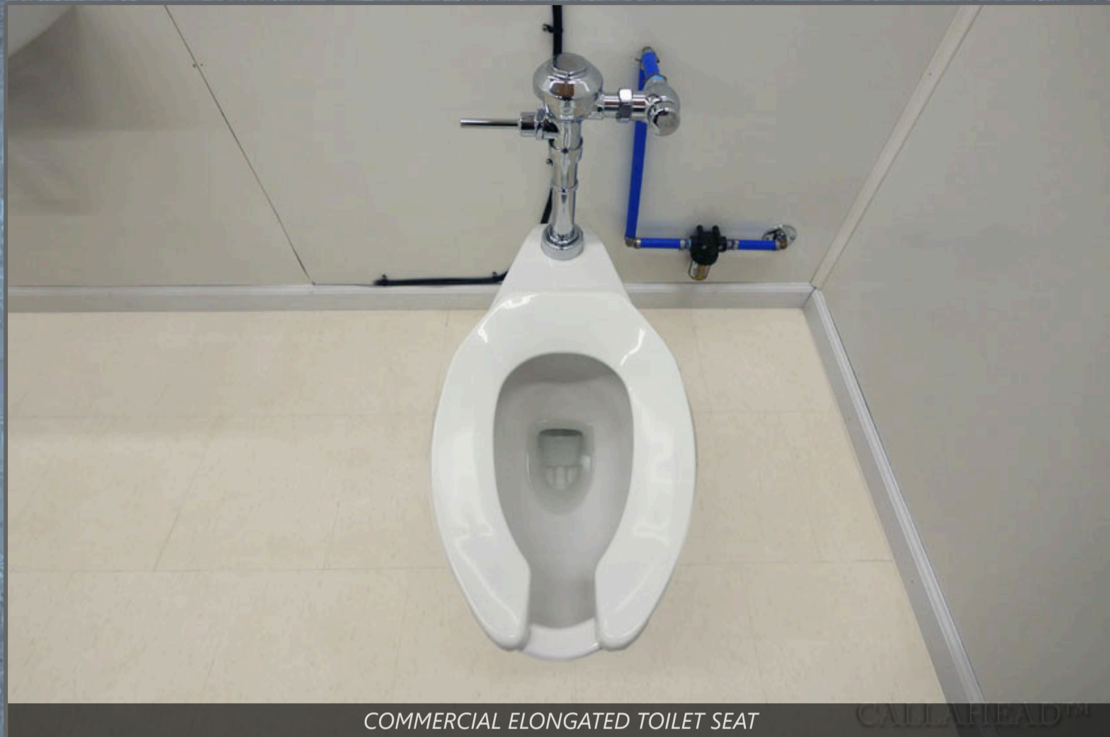
COMMERCIAL ELONGATED TOILET SEAT

every location. By focusing exclusively on New York, CALLAHEAD maintains strict quality control, guaranteeing that neither equipment nor service is ever compromised.