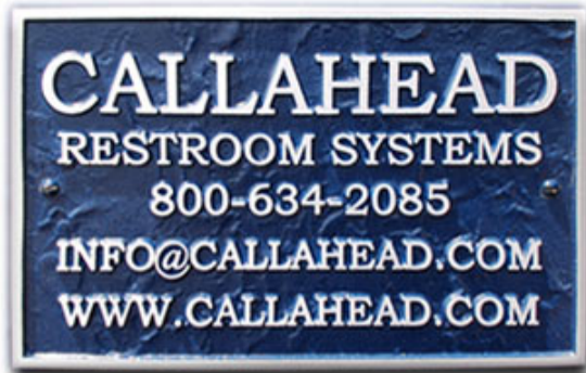
6" X 5" ENGRAVED PLAQUE