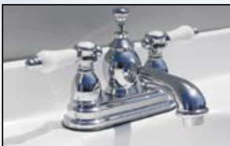
Stainless faucet with dual porcelain handles.

The drain and trap of the CALLAHEAD PORCELAIN SINK SYSTEM can go straight through the floor to the crawl space to hook up to the waste tank for typical office trailers. It can also turn after the trap and go straight out of the wall behind the sink and down to the waste tank sitting on the outside wall of the trailer. This version is most often done for containment office trailers that sit directly on the ground and do not have any crawl space underneath for waste tanks and equipment.