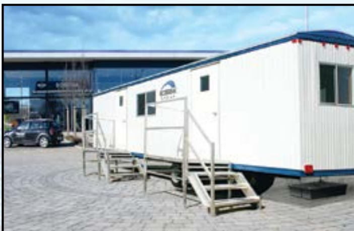
Construction office trailer.

A pedestal sink is also a perfect option for the CALLAHEAD PORCELAIN SINK SYSTEM . With a pedestal sink, the pump mounts conveniently underneath the sink on the back wall, and the plumbing lines are tucked underneath both in front of the pump and to the sides. The hot water heater mounts on the floor directly underneath the pedestal sink. The CALLAHEAD chrome faucet mounts on to the sink and has either a 4-inch or 8-inch spread. We offer both of these faucets, and CALLAHEAD has installed thousands of PORCELAIN SINK SYSTEM with pedestal sinks.