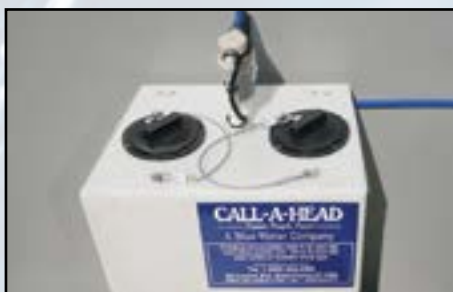
Fresh water thick-walled polyethylene tank for strength.