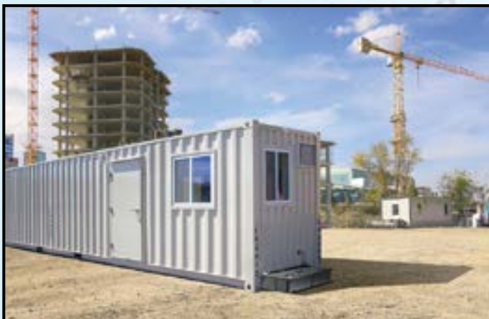
40 foot construction container.

The main components of our PORCELAIN SINK SYSTEM include a vanity sink that operates just like any kitchen sink with counter space, a faucet, and hot and cold running water. There are a 110-volt electric on-demand pump, Bosch hot water heater, and a suitcase-style 35-gallon freshwater tank that utilizes very minimal space. Water filters, strainers, check valve, pick-up line, and an automatic low water shut-off switch are also included. The PORCELAIN SINK SYSTEM has two strainers with stainless steel mesh filters. One strainer is connected to the pick-up line, and another connected to the on-demand pump to provide a double filter system to remove particles and debris. A separate black polyethylene gray water waste is placed directly outside the trailer and is equipped with an electric heater to prevent freeze-ups.