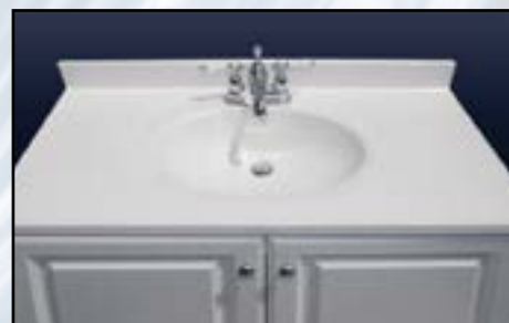
Full sized vanity with Corian countertop.

The PORCELAIN SINK SYSTEM 's 50-gallon grey water holding tank is black and is a durable ¼ inch thick polyethylene material and set-up directly outside the office trailer or container trailer. CALLAHEAD designed our grey water holding tanks with two 3-inch threaded female flange connections with caps. There are also three 10-inch black equipment covers to allow for the installation of equipment inside the grey water holding tanks such as heaters, pumps, water shut-off valves, high water alarms, etc. The equipment covers and caps also allow for our service technicians to supply our hospital-grade sanitary cleaning inside the grey water holding tank at each service. All caps and covers on the grey water holding tank also include plastic-coated cables connected to the tank so they will never get lost. CALLAHEAD's PORCELAIN SINK SYSTEM was invented and perfected by CALLAHEAD to ensure you won't have to worry about having greywater overflows or freeze-ups in winter. Inside our grey water tank is an electric 110-volt heater sitting at the bottom. When the temperature outside drops below 40-degrees, the waste tank heater automatically turns on to prevent any freezing. When serviced, a CALLAHEAD waste tank truck will pump all the grey water from the waste tank and sanitize the inside with cleaners and disinfectants.