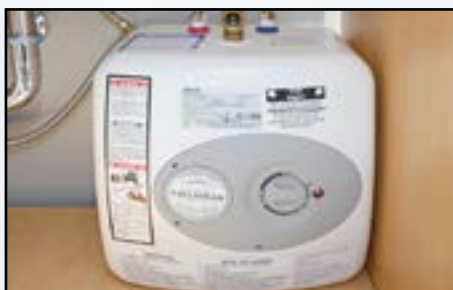
Superior quality Bosch hot water heater.