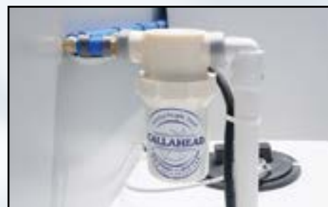
Fresh water filter/strainer.