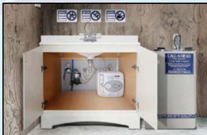
Water pump and hot water heater are contained under vanity.

The freshwater holding tank of CALLAHEAD's PORCELAIN SINK SYSTEM is a suitcase-style 1/4 inch thick semi-clear polyethylene plastic filled with 35-gallons of fresh non-potable and non-drinkable sink water. The suitcase-style freshwater holding tank is compact to take up minimal space inside the office trailer or container trailer. The freshwater tank is designed to take up as little floor space as possible. It can go up against any wall vertically or horizontally. Our fresh holding tank dimensions are only 12-inches deep, 20-inches high, and 30-inches wide when horizontal. When the tank is placed vertically, it will remain 8-inches deep and changes to 30-inches in height and 20-inches in width. The tanks semi-clear coloring makes it convenient to monitor when water is running low, and refills are required. Our freshwater tank is equipped with an automatic low water shut-off switch to prevent the pump from running when out of water. This automatic switch also will let the customer know when they are out of water for refills. The only openings for the freshwater tank are at the top of the tank, virtually eliminating water leaks. A black 4-inch cap is located on the top of the tank for easy refills. The cap has a cable connected to the tank so it will not get misplaced. The cap should always be sealed tight. CALLAHEAD's signature signage is located at the top of the tank. A CALLAHEAD refill notice sign bar is located at the bottom of the tank for convenience.