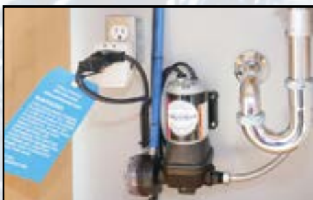
On demand pump with inline strainer.