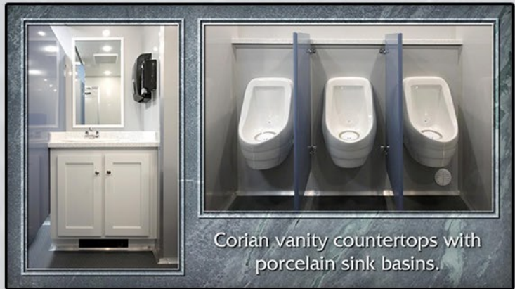
Corian vanity countertops with porcelain sink basins.