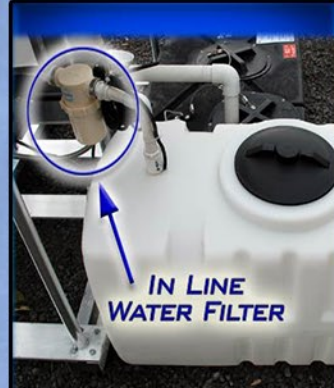
IN LINE WATER FILTER