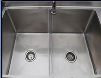
LARGE DOUBLE BASIN!

BOSCH HOT WATER HEATER • 110 volt generator • CALLAHEAD supplied fresh water OR domestic water hook up •